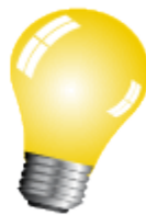
Smart Remote Control