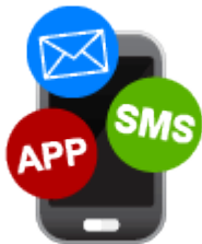
On time Alert